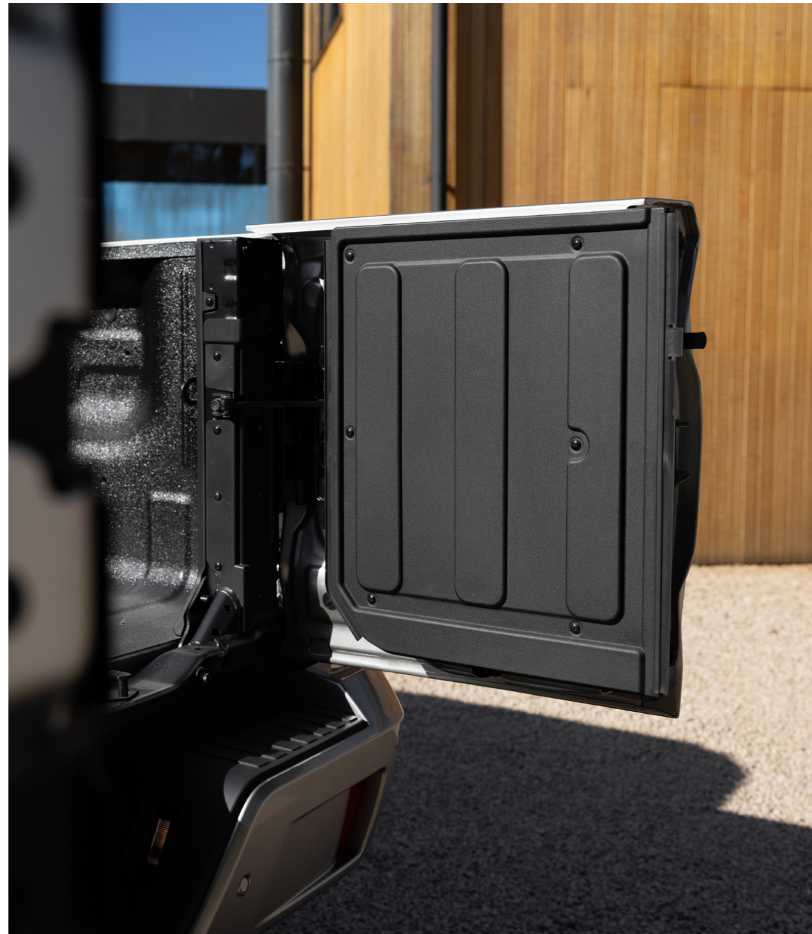
60/40 split tailgate*