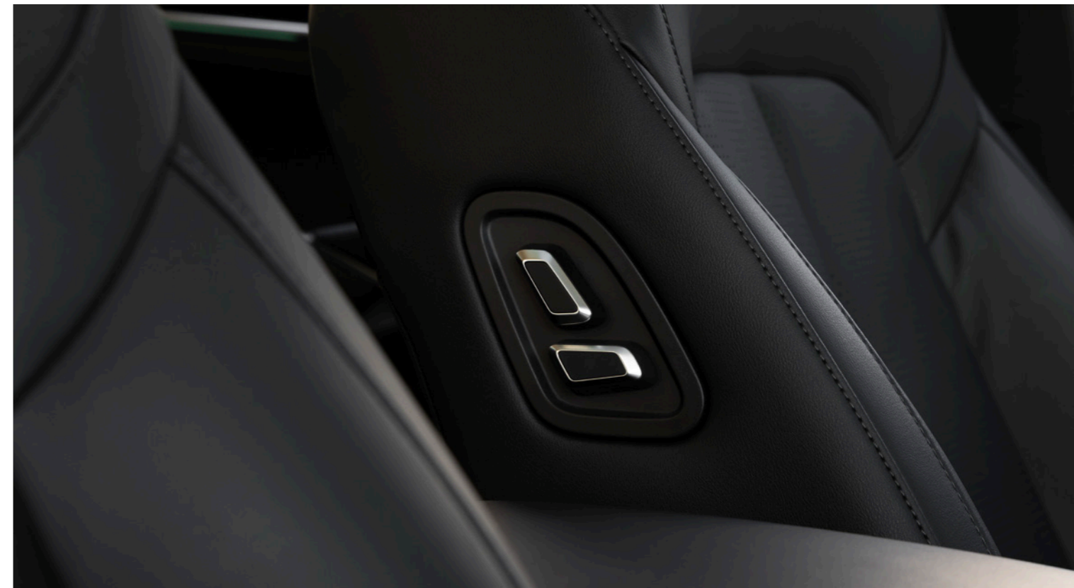
Front passenger VIP switch*