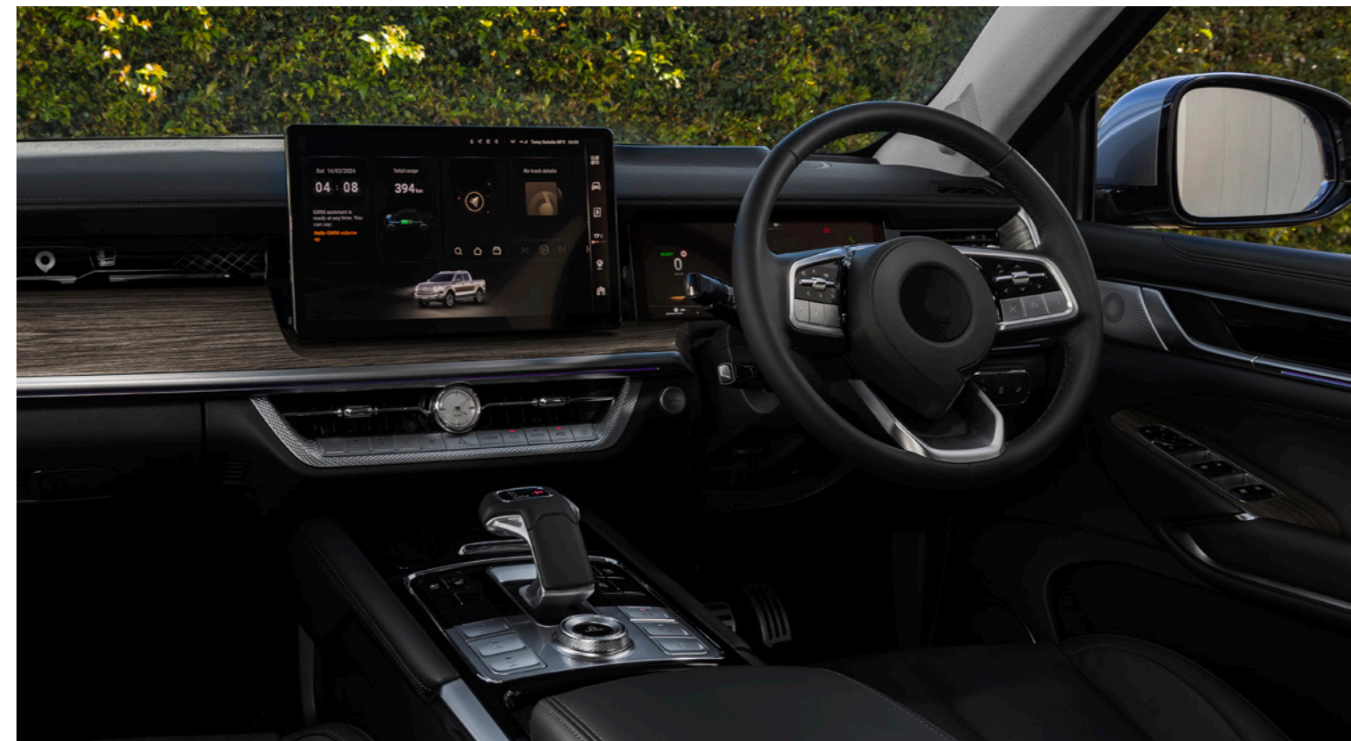
Premium appointed cabin