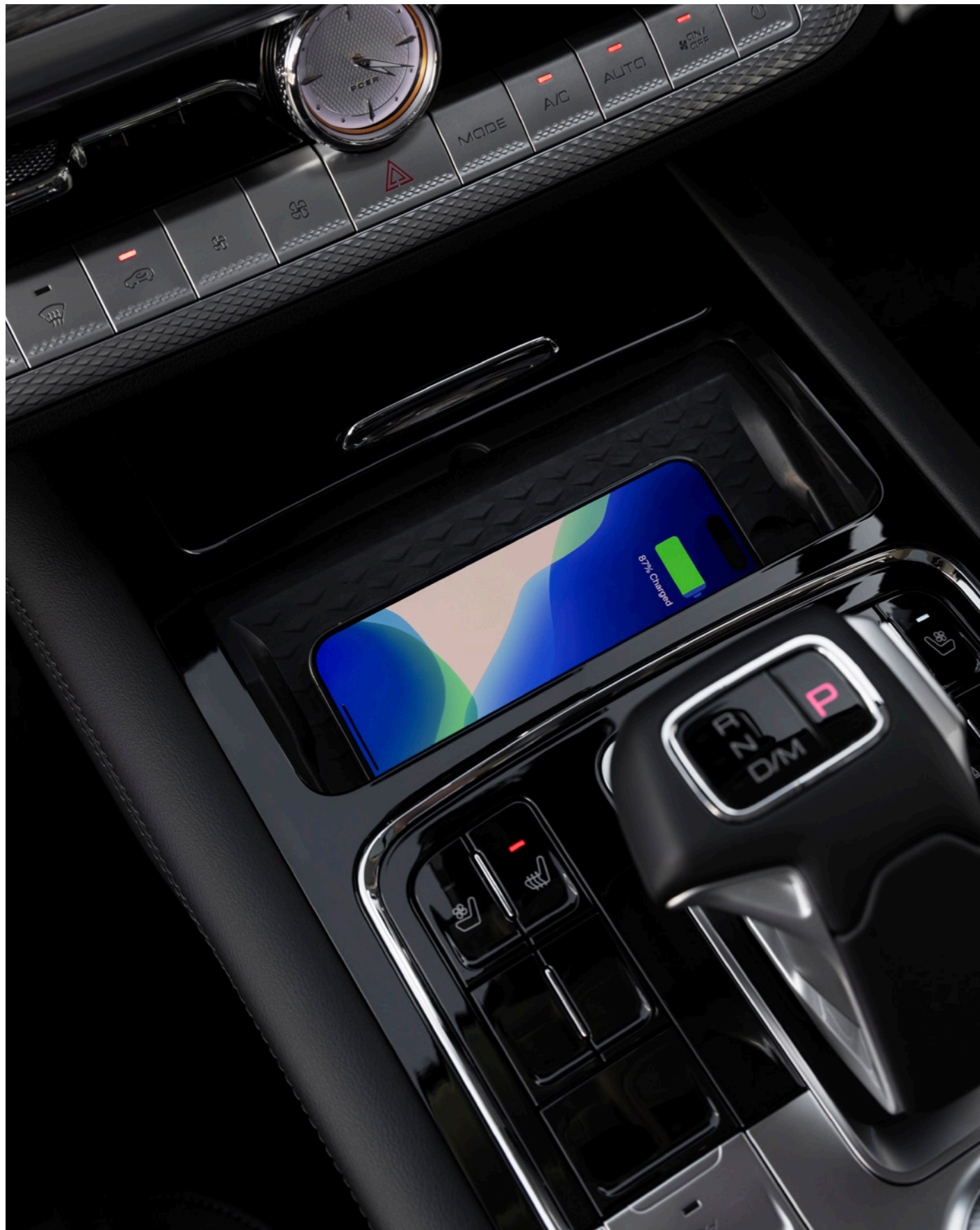
Wireless charging port