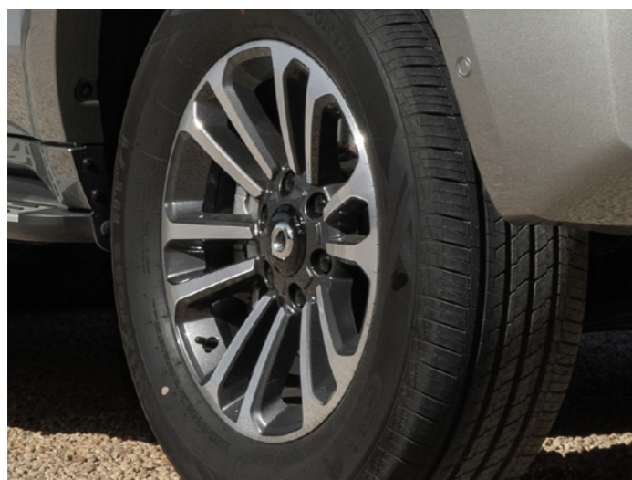
18" alloy wheels