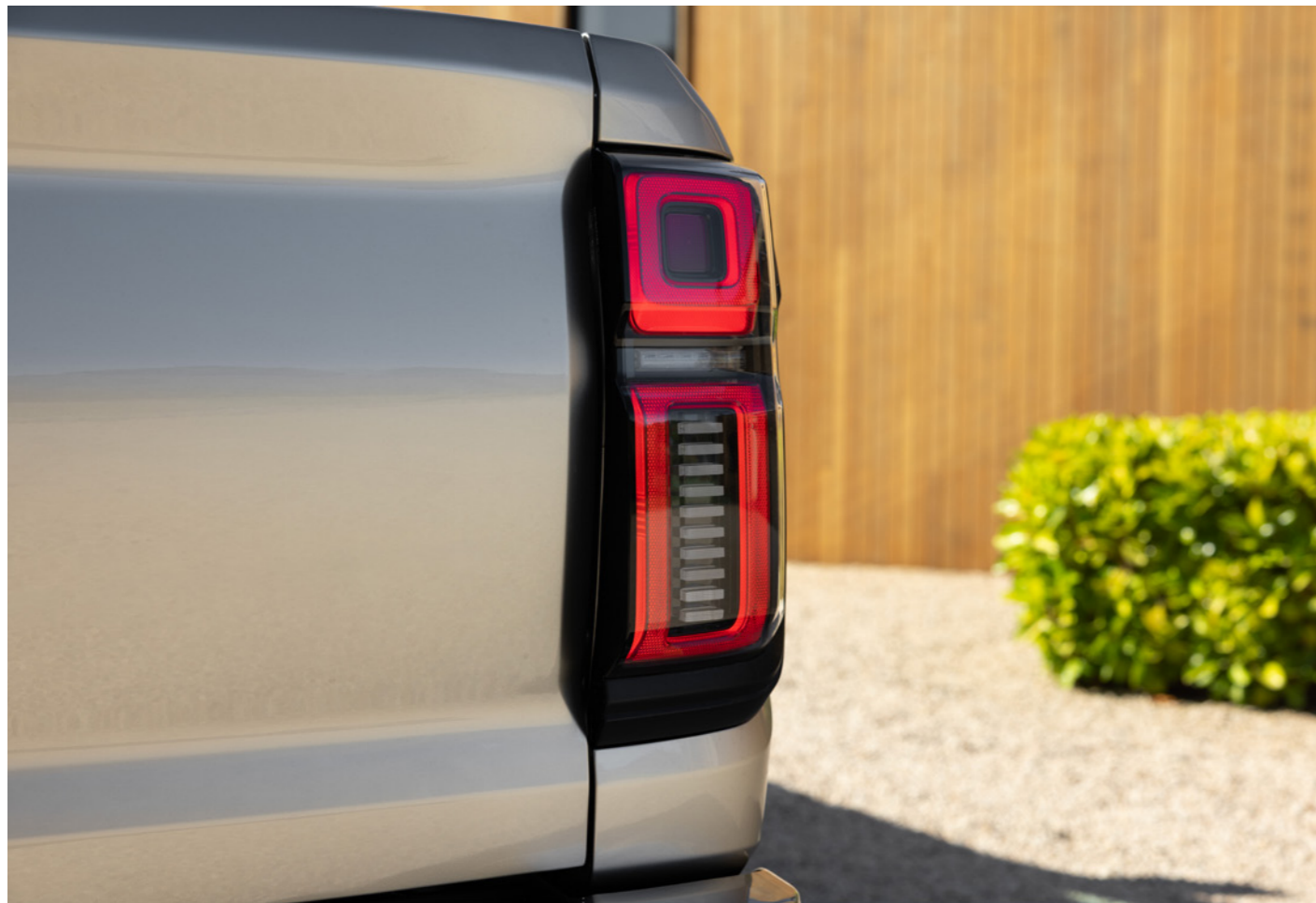
LED tail lights