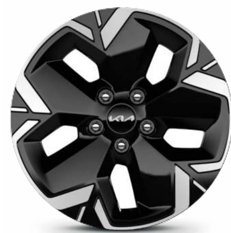
17" Alloy (EV models)