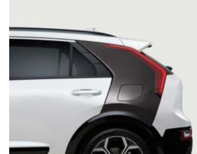
Dark Grey C-Pillar