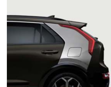
Light Grey C-Pillar