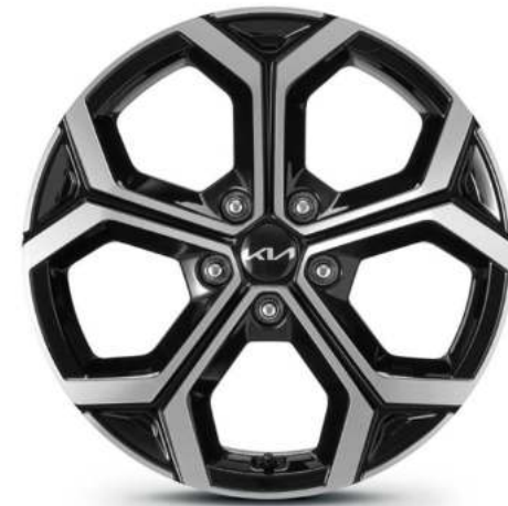
18" Alloy (Water & GT-Line models)