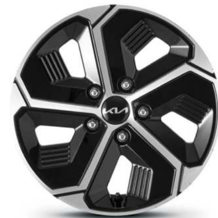
16" Alloy (Light & Earth models)