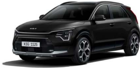
Aurora Black Not available PHEV Light