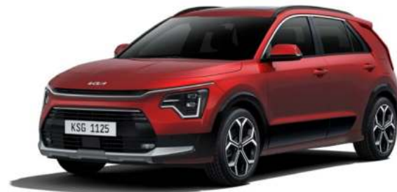
Runway Red Not available PHEV Light