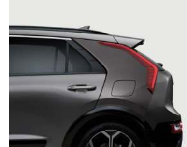
Dark Grey C-Pillar