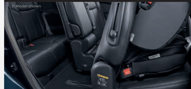
EZ FLEX® SEATING SYSTEM