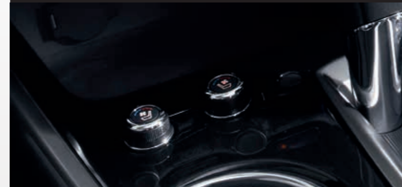
HEATED AND COOLED FRONT SEATS