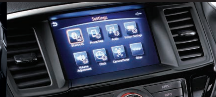
8" COLOUR TOUCHSCREEN