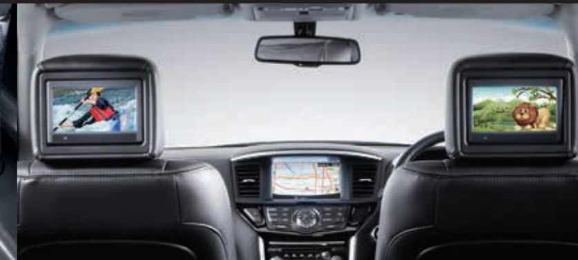
TRI-ZONE ENTERTAINMENT SYSTEM