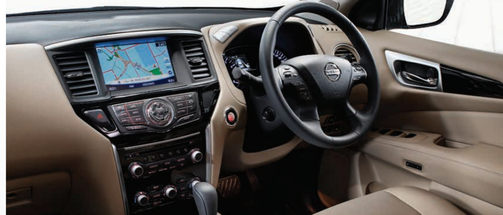
TI INTERIOR SHOWN IN IVORY LEATHER-ACCENTED TRIM*