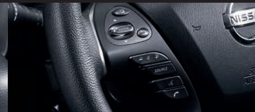
BLUETOOTH® HANDS-FREE PHONE