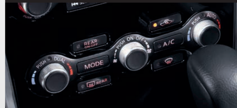
TRI-ZONE CLIMATE CONTROL