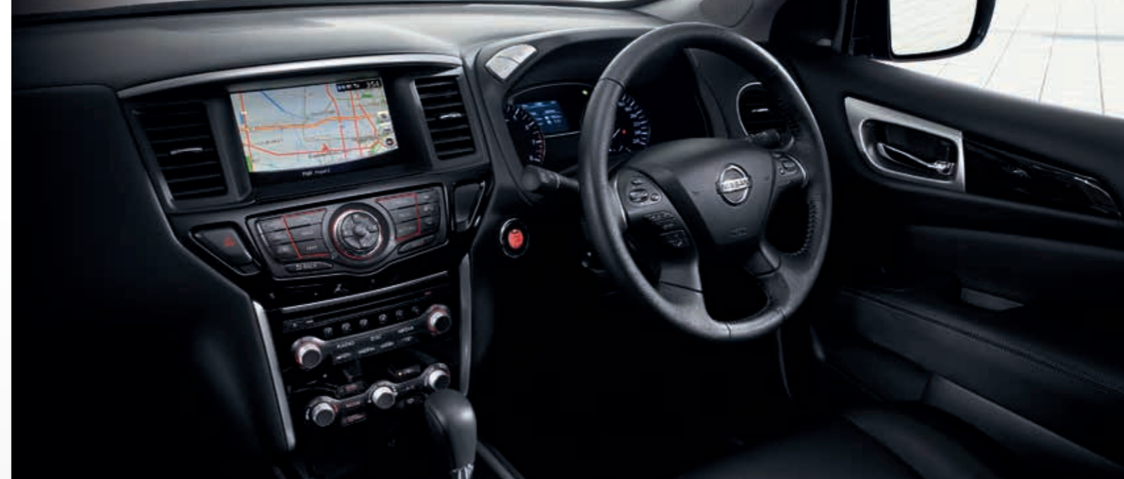
ST-L INTERIOR SHOWN IN BLACK LEATHER-ACCENTED SEAT TRIM*