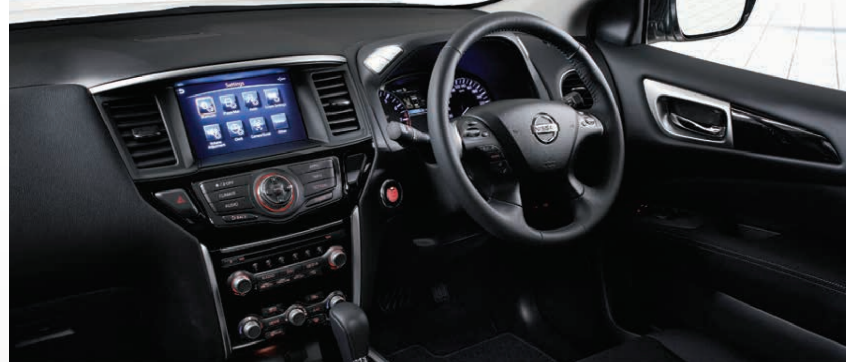
ST INTERIOR SHOWN IN BLACK CLOTH TRIM

*Leather accented features and upholstery may contain synthetic material. #4WD model only.