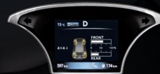
4WD TORQUE DISTRIBUTION#