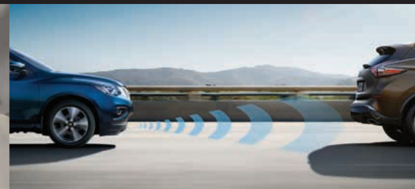
INTELLIGENT CRUISE CONTROL