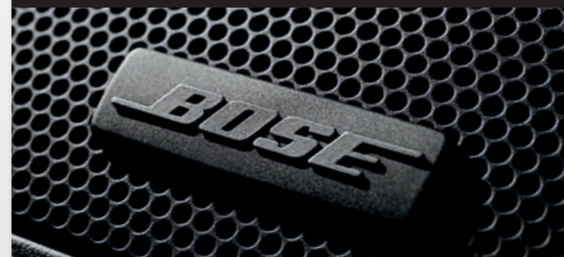
BOSE® AUDIO SYSTEM