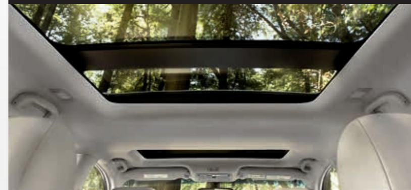
FRONT SUNROOF AND PANORAMIC GLASS ROOF