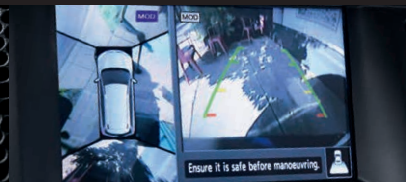
INTELLIGENT AROUND-VIEW® MONITOR