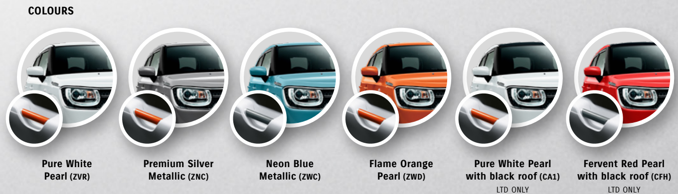
Pure White Pearl (ZVR)

Standard and optional equipment available may vary from time to time. Some international models illustrated – please enquire at your Suzuki dealer for exact specifications. Suzuki New Zealand Ltd reserves the right to change, without notice, prices, colours, materials, equipment, specifications and models, and also to discontinue models. Your fuel consumption will vary due to factors such as vehicle condition, driving style and traffic conditions.